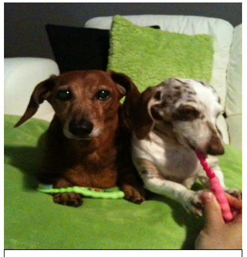
Cayenne & Mocha Bean getting their daily brushing by Angela

There is no substitute for a professional cleaning once tartar has formed on your pet's teeth, but you can help prevent build up, reducing the frequency that full cleanings are needed. The best way to do that is daily brushing.